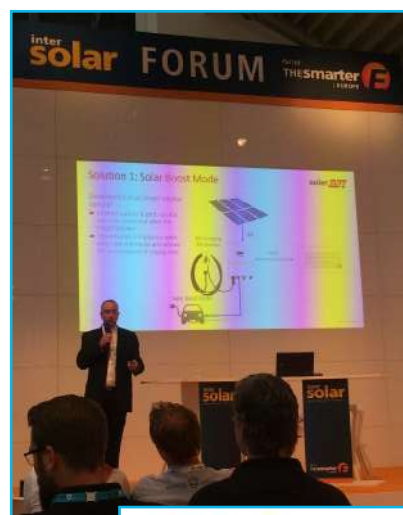
intersolar connecting solar business | EUROPE

This year's edition has been held on June 20th-22nd and SHAR-Q was represented by ENERC team, who made a project presentation and took the opportunity to contact a number of relevant stakeholders attending.